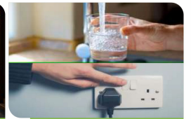
24 X 7 WATER & ELECTRICITY