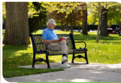
SENIOR CITIZEN SEATING AREA